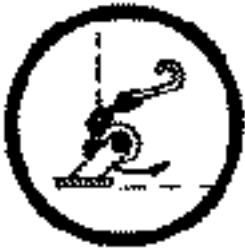
RIGHT (Roller is positioned toward tower.)